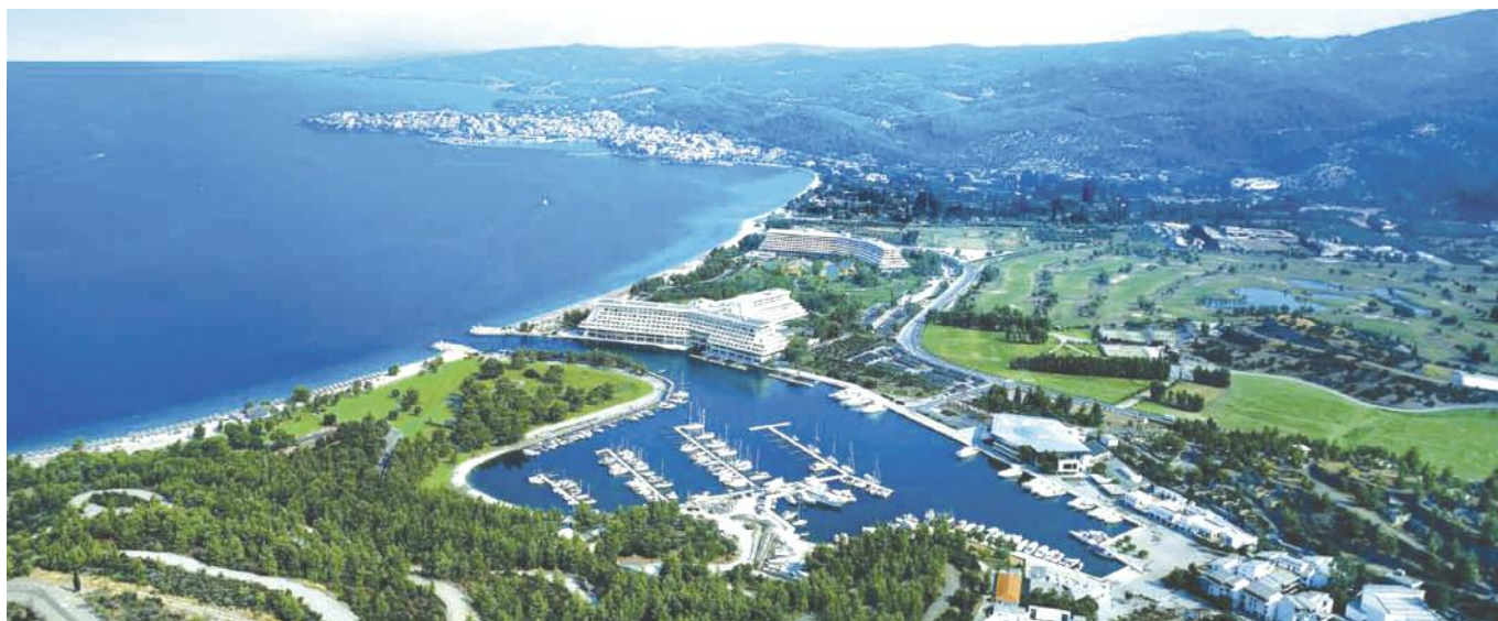
Porto Carras Grand Resort, Sithonia, Greece